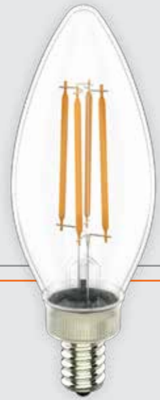
Candle Filament VO-FCAW3.8-120